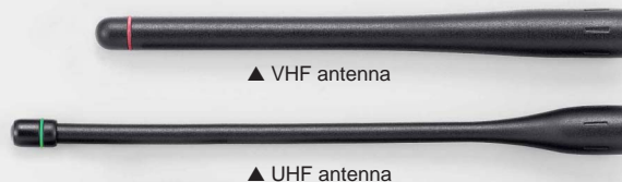
▲ VHF antenna