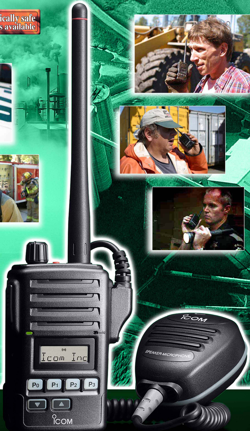
Photo includes optional speaker-microphone, HM-138.