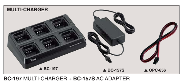
Rapidly charges up to 6 battery packs. Charger adapter AD-122 is supplied

BC-121N + AD-106 + BC-157S is also available